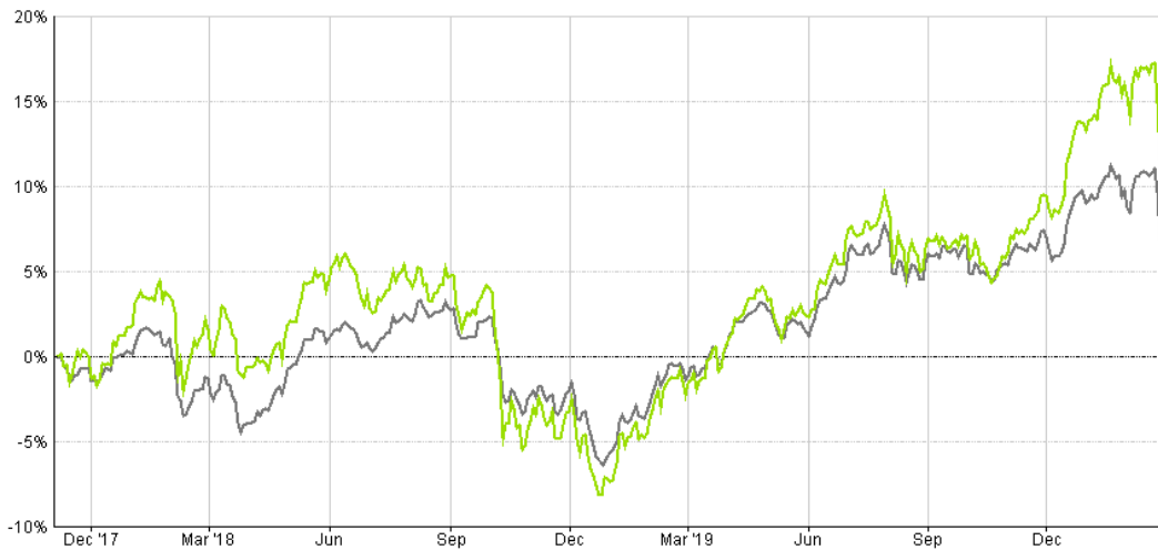
— 8AM CleverMPS 7 [6.90%] — IA Mixed Investment 40 - 85% Shares [3.62%]

Source: FE Fundinfo 06.11.2017 – 28.02.2020