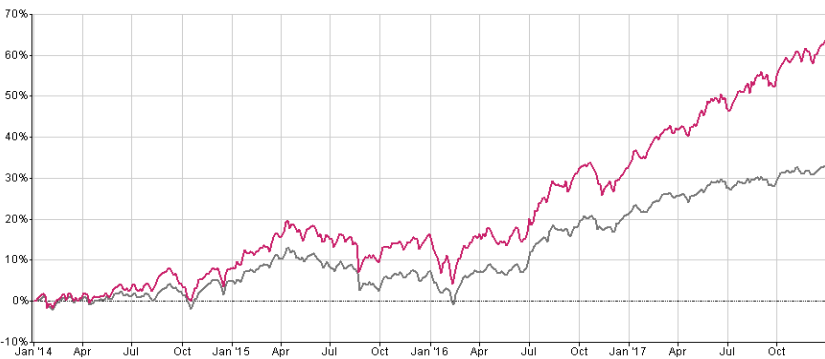
Source: Clever Research 01.01.2014 – 29.12.2017