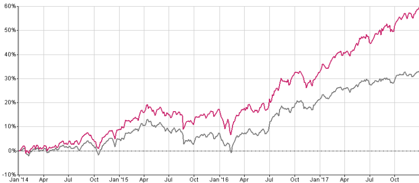
Source: Clever Research 01.01.2014 – 29.12.2017