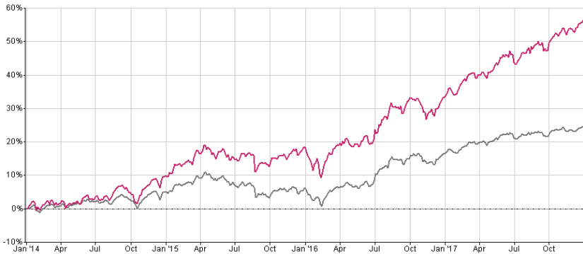
Source: Clever Research 01.01.2014 – 29.12.2017