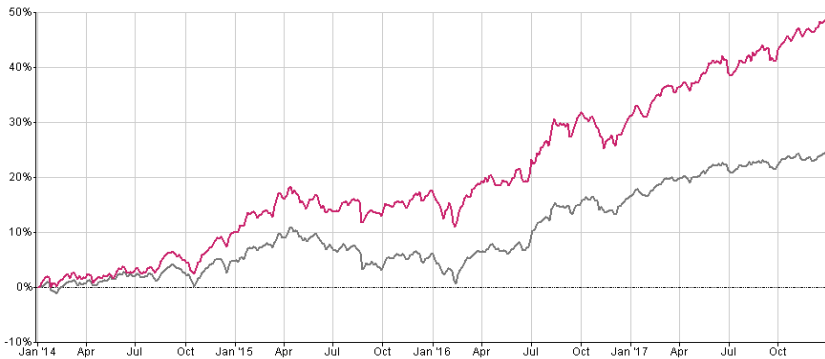
Source: Clever Research 01.01.2014 – 29.12.2017