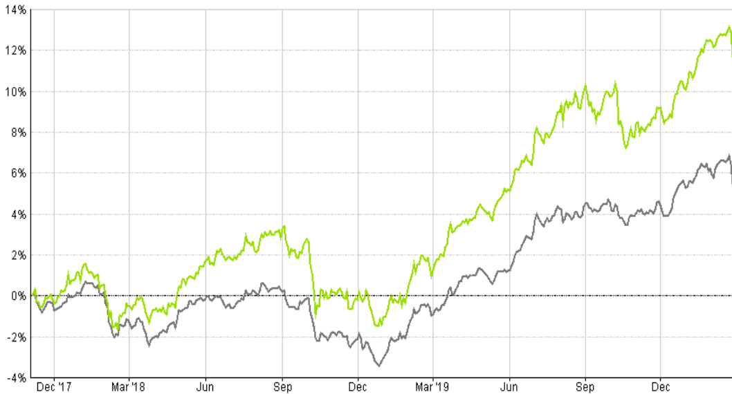
— 8AM CleverMPS 3 [9.91%] — IA Mixed Investment 0 - 35% Shares [4.20%]